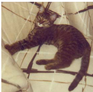
Below left: Vern in 1991; below: Vern in 2009.

fore treatment could commence very early. His life was undoubtedly prolonged as a result. We all miss him very much.' An imprint of one of Vern's paws and the urn containing his ashes are on display in our reception area.