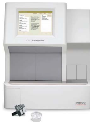
Catalyst blood analyzer